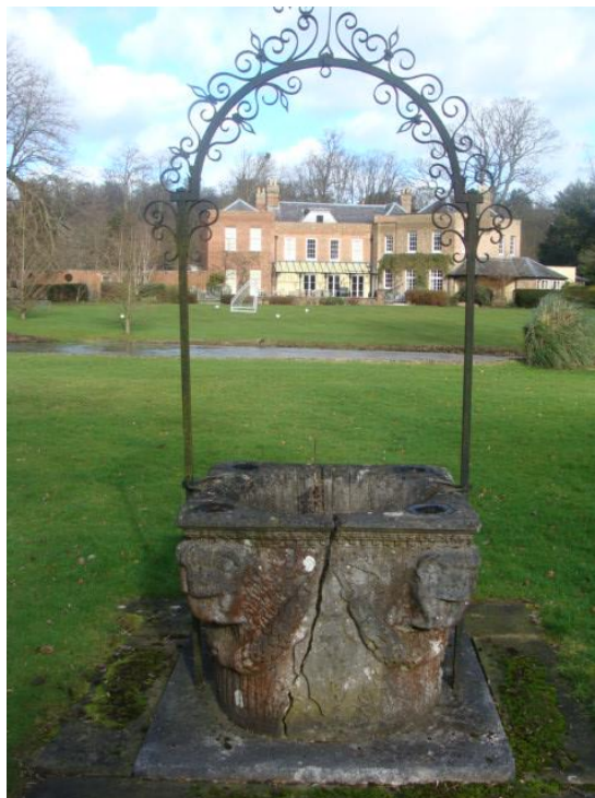
Picture 1- Epcombs viewed from south side of river. The picture shows what is interpreted as being a Venetian well head. Importing and or copying these and their use as garden ornaments was popular in the late 19th/ early 20th century. The date of this one and its arrival on site are not known but it would be entirely consistent with the Listed Building description regarding the remodelling of the grounds.

Epcombs itself is a 17th century small country house much altered and remodelled with a subsidiary wall feature with niches for sculptures (the owner advised the latter had been rebuilt). A Historic note following the Listed Building description (List Entry Number 1268856, (1973 and amended 1996) reads Epcombs originated as a pre-Conquest farm, but the later history of the estate is uncertain. The Gardens extend on both sides of the River Mimram. The house was reputedly the model for 'Longbourn' the home of the Bennetts in Jane Austen's 'Pride and Prejudice'.